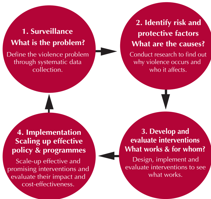
Figure 2: The Steps of the Public Health Approach

WHO (2007) http://www.who.int/violenceprevention/en/ accessed 18/01/08